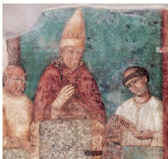
Pope Boniface VIII declaring the Jubilee Year, fresco by Giotto in the Basilica of St. John Lateran, Rome

For more information on the Battle of Westrozebeke/Roosebeke: