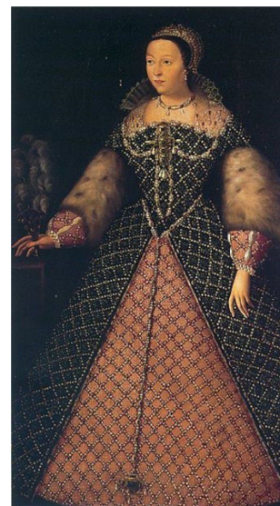
Portrait of Catherine of Medici (1519-1589) - artist unknown

After Catherine de' Medici introduced ice cream to France in mid-16th century, ice creams started their incredible rise. Production capabilities changed with century to century, new recipes and fashions were formed, refrigeration techniques and automated machines were introduced, and ice creams traveled to all four corners of the world. United States received their first ice cream in mid-17th century, few decades later it was sold in public, and in 1851 it was made by large commercial enterprises. 2