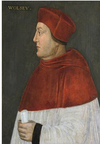
Cardinal Thomas Wolsey (1475-1530), Royal Minister, Archbishop of York, painter unknown.

For more information on Charles VI of France: