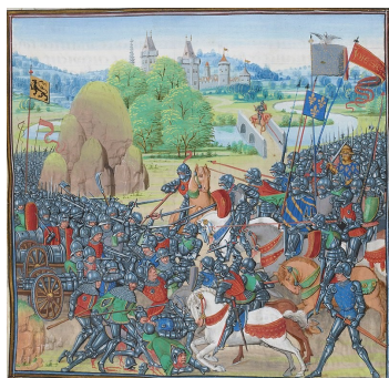
Slag bij Westrozebeke, Kroniek van Jean Froissart (1405)