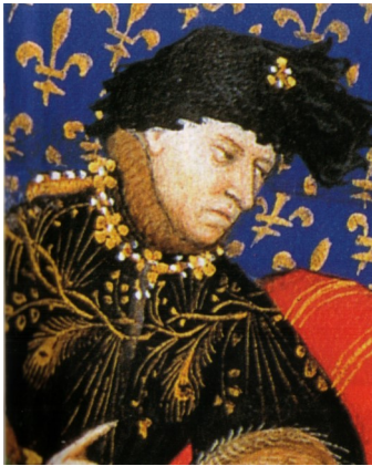
Charles VI by the painter known as the Master of Boucicaut (1412).

November 14, 1380 King Charles VI of France crowned at age 12