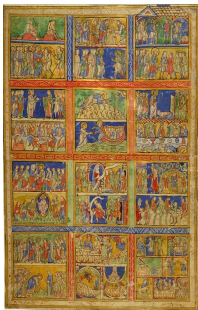
Biblical cycle, leaf from the prefatory cycle of the Eadwine Psalter

England, Canterbury, Christ Church Priory