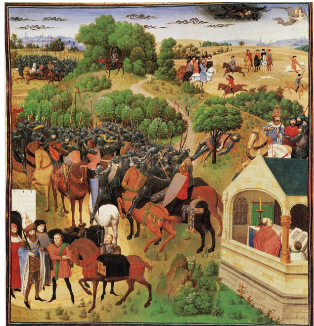
Grandes Chroniques de France, St. Petersburg, Ms. Hermitage. fr. 88

King Marsilies he lay at Sarraguce, Went he his way into an orchard cool; There on a throne he sate, of marble blue, Round him his men, full twenty thousand, stood. Called he forth then his counts, also his dukes: "My Lords, give ear to our impending doom: That Emperour, Charles of France the Douce, Into this land is come, us to confuse. I have no host in battle him to prove, Nor have I strength his forces to undo. Counsel me then, ye that are wise and true; Can ye ward off this present death and dule?" What word to say no pagan of them knew, Save Blancandrin, of th' Castle of Val Funde.