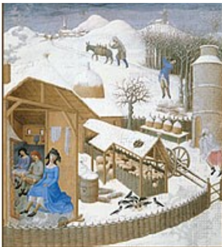
The Belles Heures of Jean de Berry