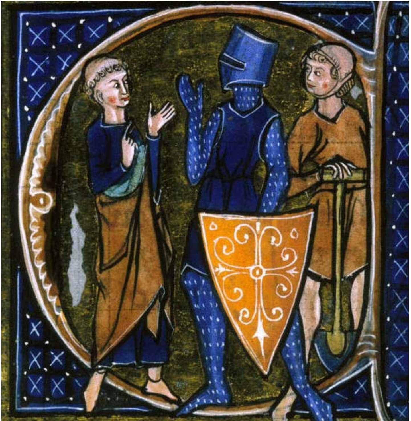
Cleric, Knight, and Workman