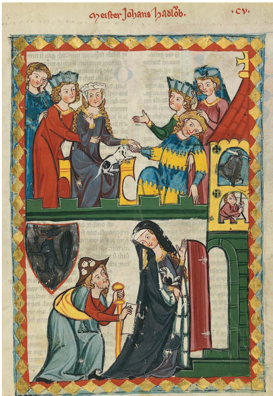
Codex Manesse, UB Heidelberg, Cod. Pal. germ. 848, fol. 371r, Meister Johannes Hadlaub

http://commons.wikimedia.org/wiki/File:Codex_Manesse_Johannes_Hadlaub.jpg