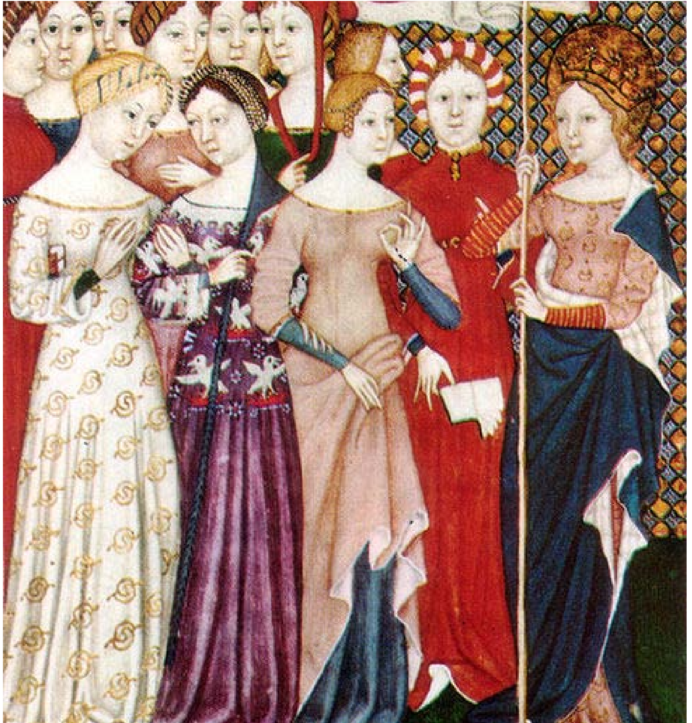
Italian breviary showing women's figured silk gowns and a saint, circa 1380