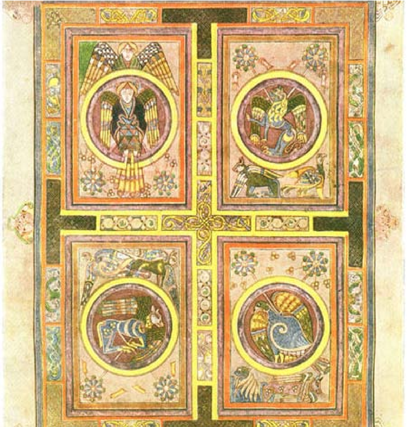
Book of Kells, Folio 129v, Four Evangelists' Symbols