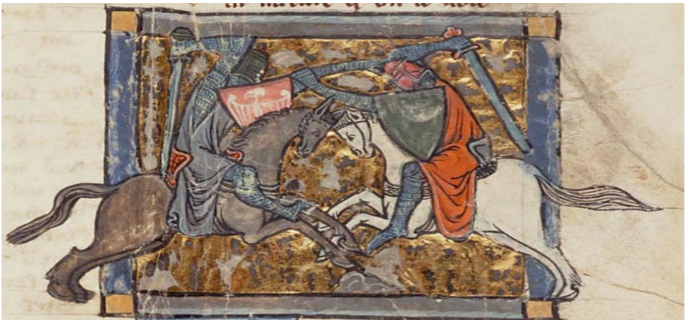
a miniature from Garrett MS. No. 125 (ca. 1295)