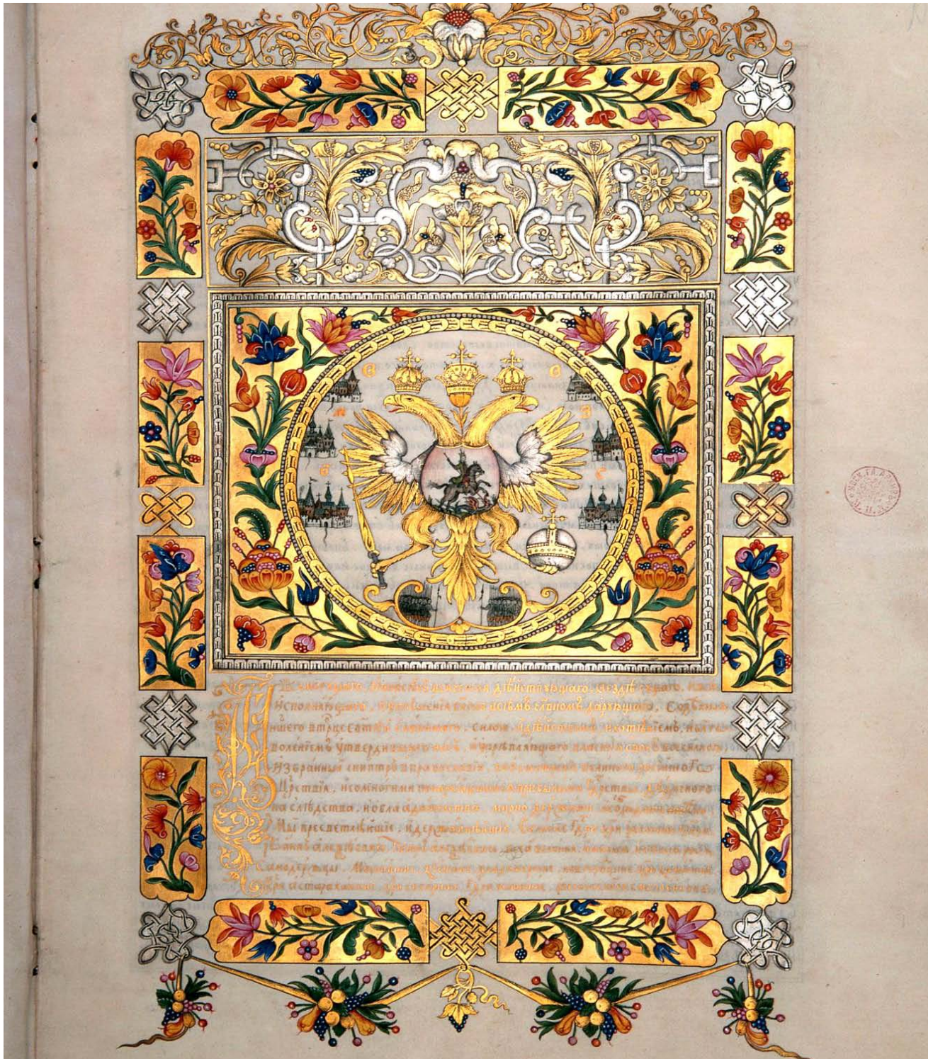
Polish Russian peace agreement 1686 (Grzymułtowski treaty)