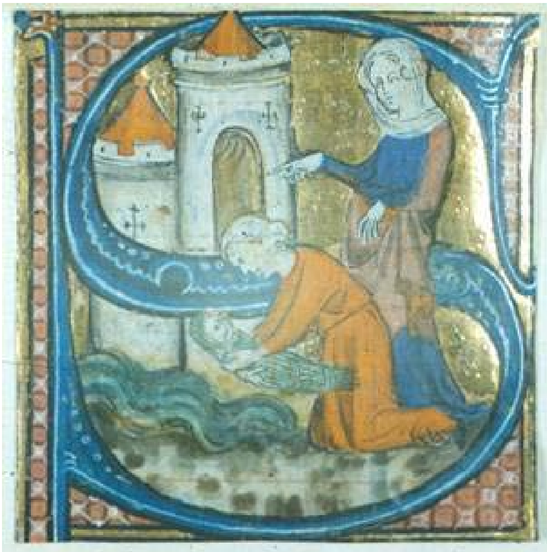
From folio 6r from the Breviary of Chertsey Abbey, a 14th century illuminated manuscript.

Pg 14 A capital S contains a miniature of Moses being found by the Pharaoh's daughter. From folio 6r from the Breviary of Chertsey Abbey, a 14th century illuminated manuscript. http://commons.wikimedia.org/wiki/File:Breviary_of_Chertsey_Abbey_(folio_6r).jpg