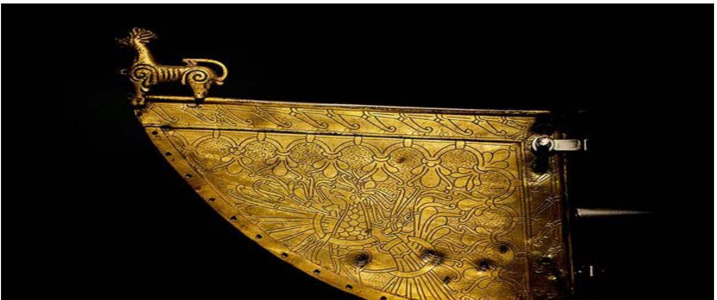
A sculpted brass lion on this 11th-century gilded copper weather vane