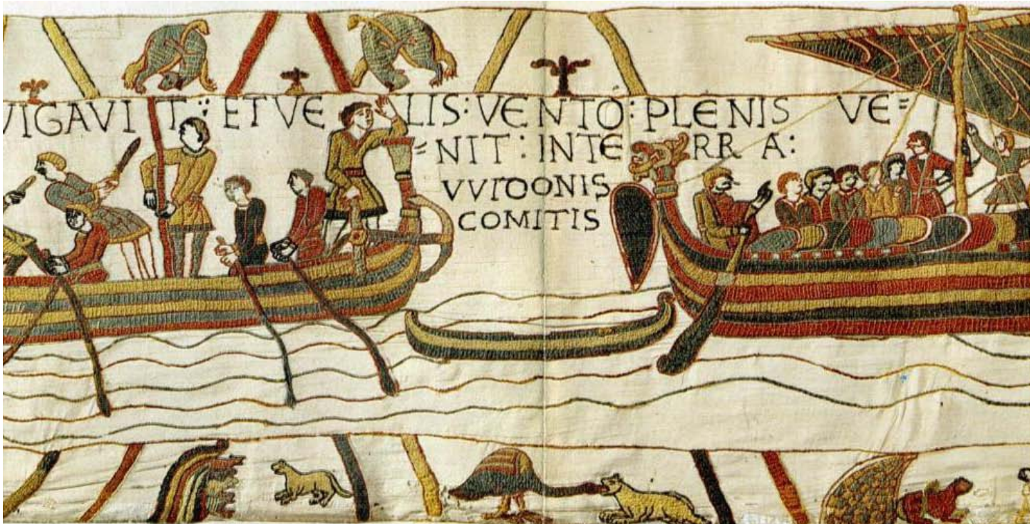
A detail showing the Aesop's fable of the Wolf and the Crane, 11th century, Bayeux Tapestry