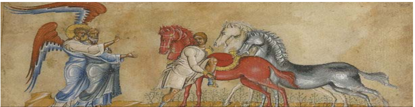
The Vision of Zechariah (about 1300)

Compassion is not a deciding factor, it is a mitigating factor. It helps to maintain a balance between a cold-harsh decision and a foolish decision with significant consequences. That being said, the best decisions are based primarily on merit with a smidgen of compassion both in the real world and in the SCA.