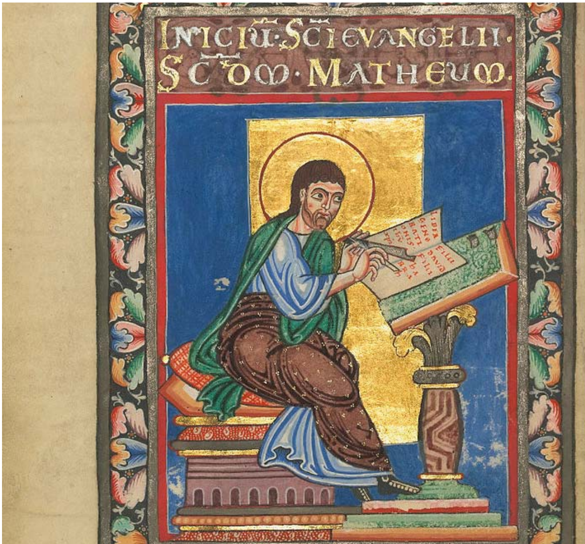
Saint Matthew (about 1120 - 1140)

http://commons.wikimedia.org/wiki/File:Saint_Matthew_-_Google_Art_Project_(6825190).jpg