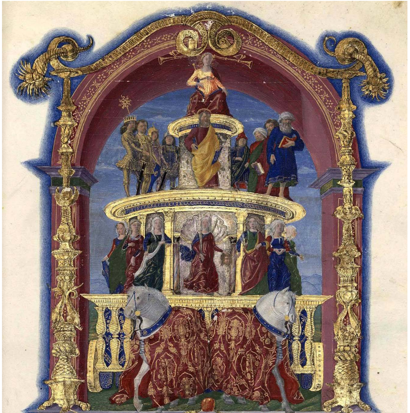
Triunfo de la Fama (Siglo XV / 15th century)