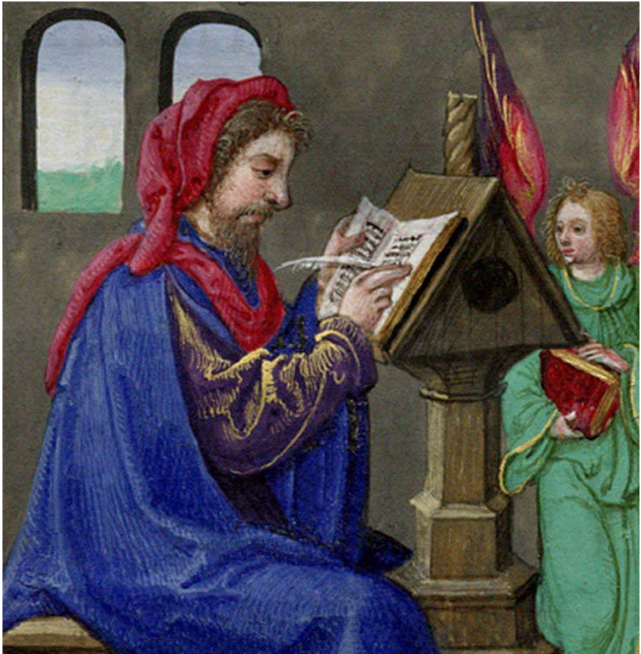
Page detail from Mediaeval Book of Hours (1533)

http://commons.wikimedia.org/wiki/File:Book_of_Hours_detail.jpg