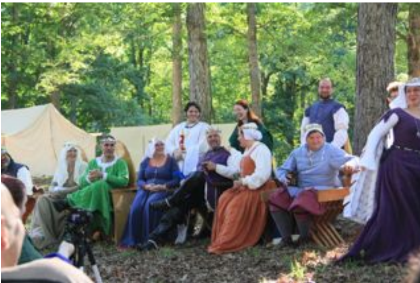
Their Highness play musical chairs with some of the Barons and Baroness' during Royal Court.