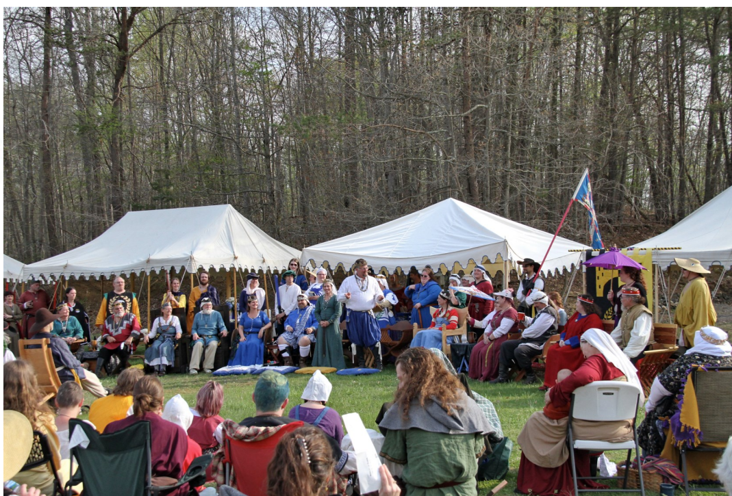
Night on the Town—Night of the Tartan 2017: Court Saturday Evening