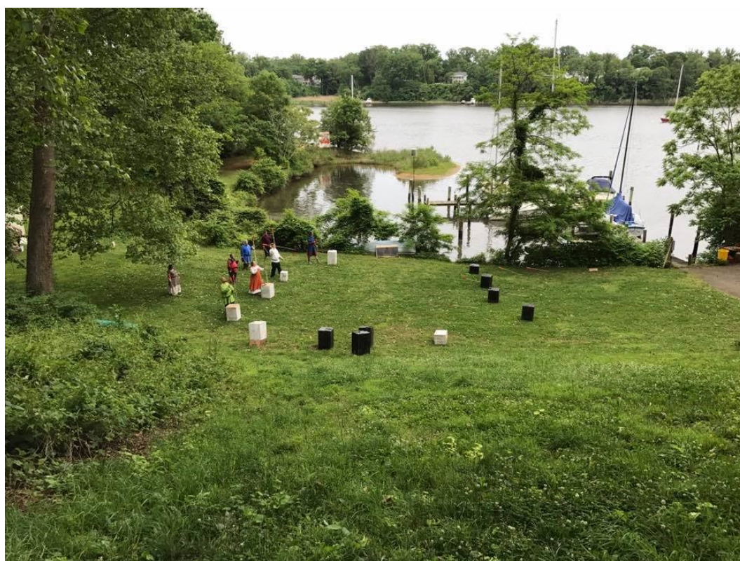
On Target—May 20 2017: Archers Enjoying the Day's Activities