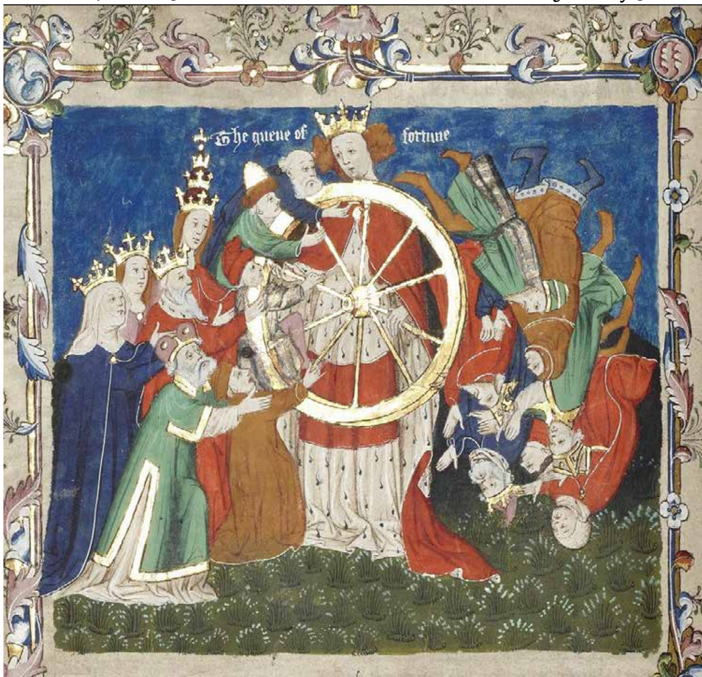
Illustration from John Lydgate's Siege of Troy (mid-15th Century)