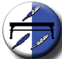
Minister of the Lists Mistress Genevieve d'Aquitaine