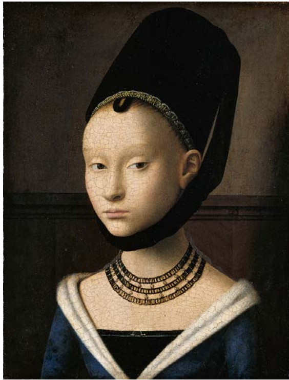
Portrait of a Young Woman, circa 1470

Pg 16 Portrait of a Young Woman, circa 1470, http://en.wikipedia.org/wiki/File:Petrus_Christus_-_Portrait_of_a_Young_Woman_-_Google_Art_Project.jpg