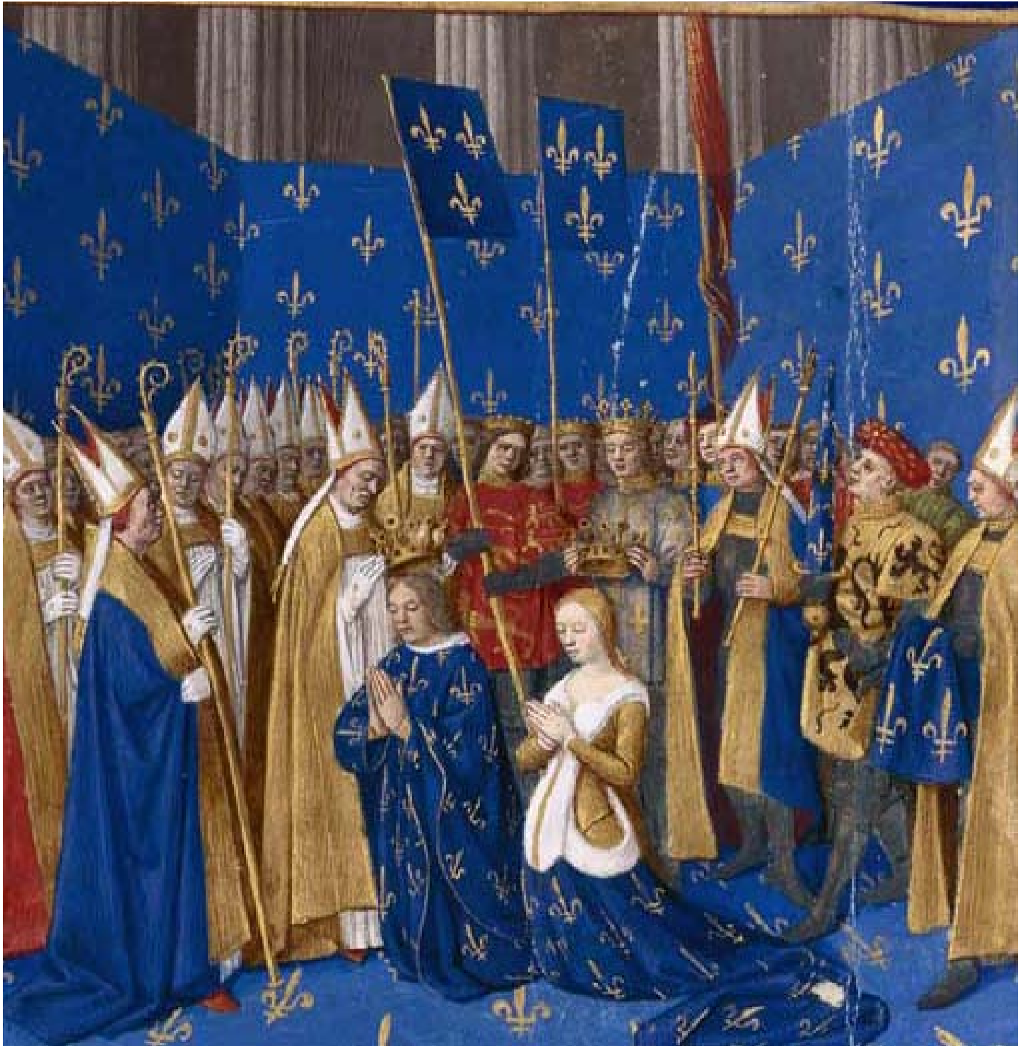
Coronation of Louis VIII and Blanche of Castile at Reims in 1223 (painted in the 1450s)