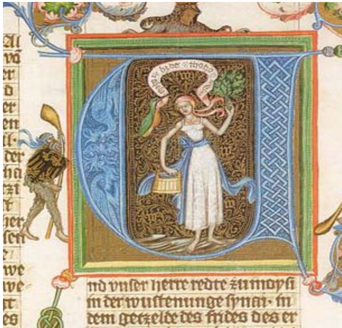
Österreichische Nationalbibliothek, Codex Vindobonensis

Pg 16 Wenzelsbibel (130r); Wien, Österreichische Nationalbibliothek, Codex Vindobonensis 2759-2764 (ca. 1389-1400 ) http://commons.wikimedia.org/wiki/File:Wenzelsbibel03.jpg