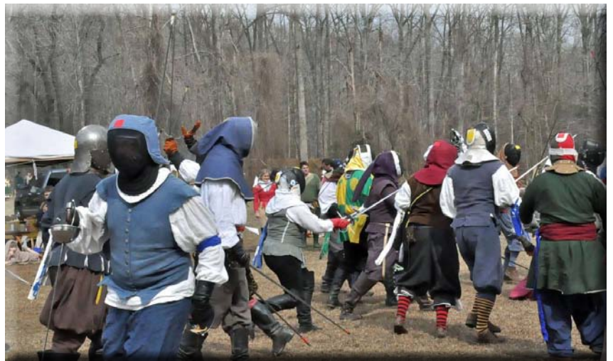
A Day of Melee Battles