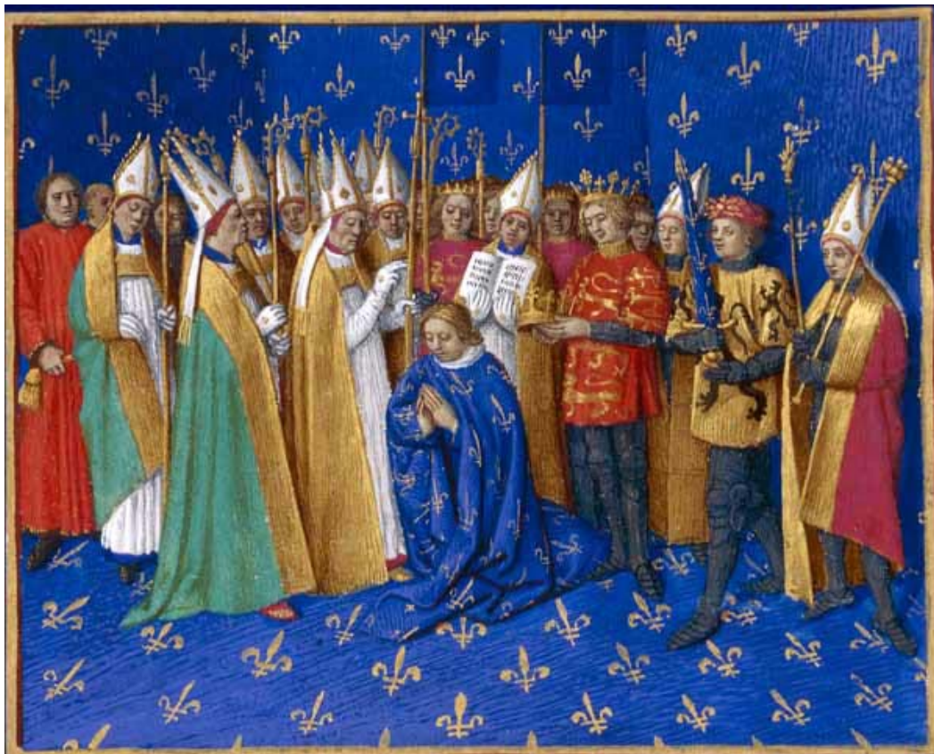
Couronnement de Philippe Auguste (vers 1455)

http://en.wikipedia.org/wiki/File:Couronnement_de_Philippe_Auguste.jpg