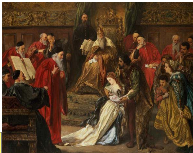
Cordelia in the Court of King Lear (1873) by Sir John-Gilber, Townley Hall Museum, Burnley

Kick off William Shakespeare's 450th birthday year with this wide-ranging, often unexpected display drawn from our unequalled Shakespeare holdings.