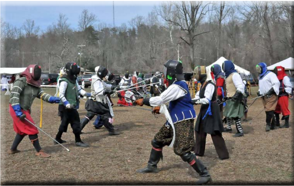
Atlantia's Premier Rapier Event