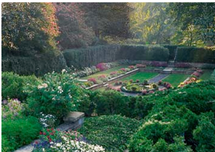
Agcroft Hall Sunken Garden - Richmond, Virginia

http://www.tudorplace.org/the-garden.html