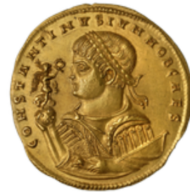
Medallion of Constantine II, ca. 326–327 (BZC.1949.5)

Dumbarton Oaks' world famous collection of Byzantine objects is equaled in importance and diversity by its collection of Byzantine coins and medallions. It comprises more than 12,000 specimens and covers the entire history of the long-lived empire. Although the collection includes some representative examples from the third century, comprehensive documentation begins with Constantine the Great (r. 306–337), who founded Constantinople in 324 CE, and continues through all the imperial rulers, many empresses, and even a number of usurpers up to the last legitimate ruler, Constantine XI (r. 1449–1453), who died defending the capital city against the Ottoman Turks. There are examples of all the denominations struck at different times in the economic history of Byzantium, including gold, silver, bronze, electrum, and copper issues that, in five major catalogues, have been interpreted and made available to the scholarly and interested public.